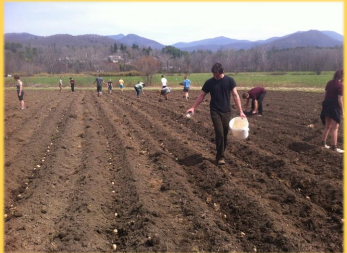
Students Planting Seed Potatoes at Warren Wilson College in Swannanoa, NC

Plants spaced farther apart are better suited to withstand drought, and have easier access to distant nutrients in poor soil.