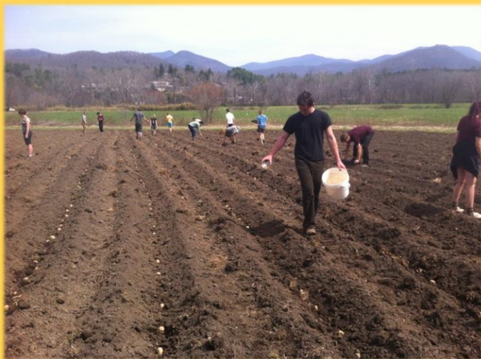
Students Planting Seed Potatoes at Warren Wilson College in Swannanoa, NC

Plants spaced farther apart are better suited to withstand drought, and have easier access to distant nutrients in poor soil.